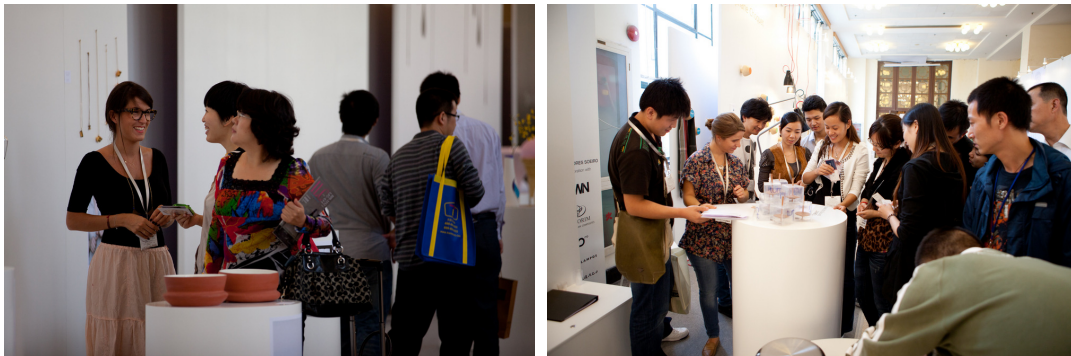
* Resource: 2011 onsite pictures

“talents” is designed to bridge between young aspiring designers and the interior industry. We give young designers and their innovative ideas the chance to present their design-oriented and avant-garde tableware, gifts, home accessories, furniture, lighting and textiles at this special area.